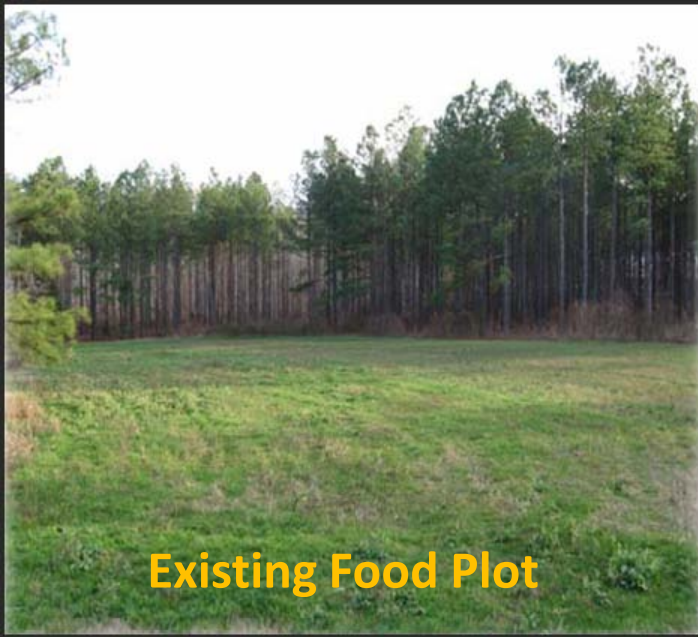
Existing Food Plot