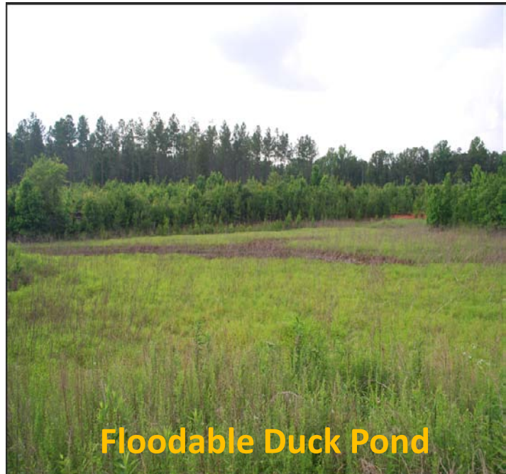
Floodable Duck Pond