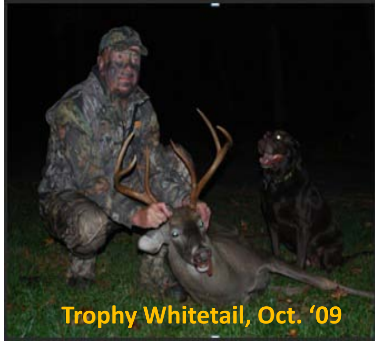
Trophy Whitetail, Oct. '09

Tract Size: 106 +/- acres Price: $975,000 Zoning: None Utilities: Power & Water Frontage: 1,700 ft. on Augusta Rd. Location: Pelzer, SC