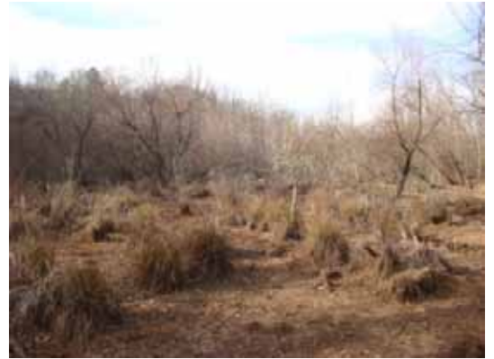
Natural beaver pond area