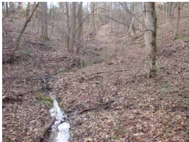
Spring-fed creek on site