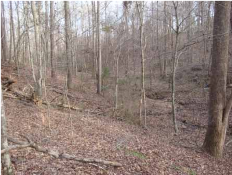
Mature hardwood forest