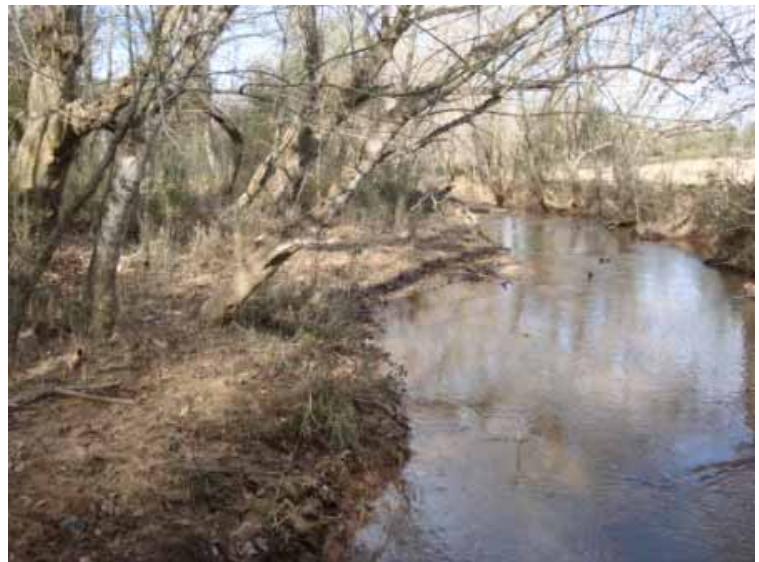
South Rabon Creek on the eastern boundary