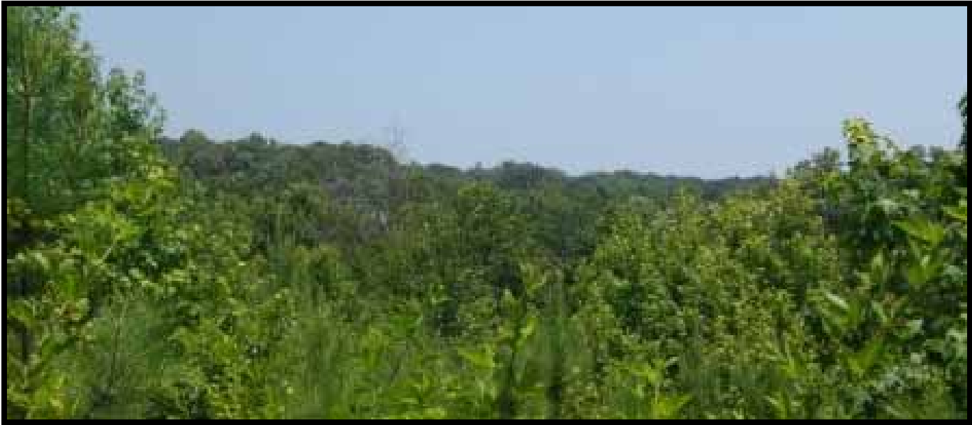
Wonderful view from potential house site