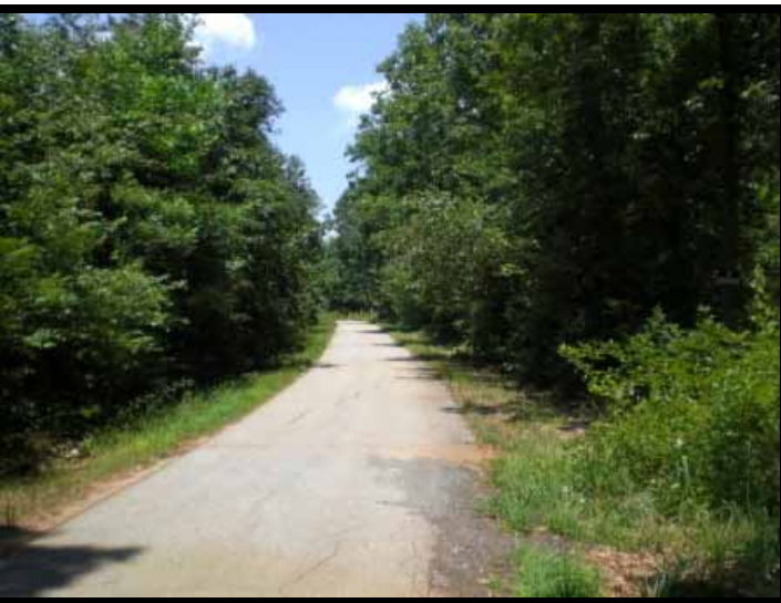
Frontage on Country Lane