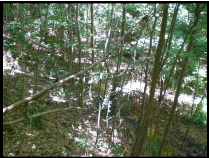
Tributary of North Rabon Creek