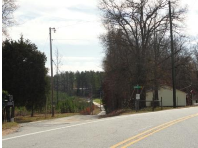
Entrance to Bowater Pass off Hillside Church Rd.