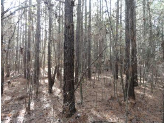
Pine timber, approx. 20 yrs old