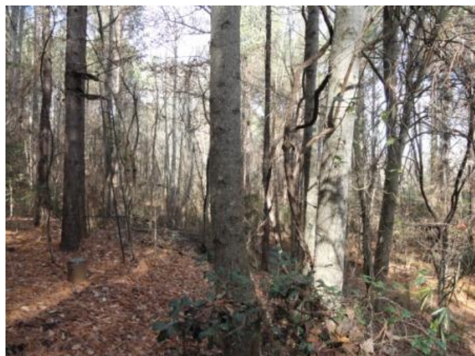
Deer stand overlooking Craigo Creek