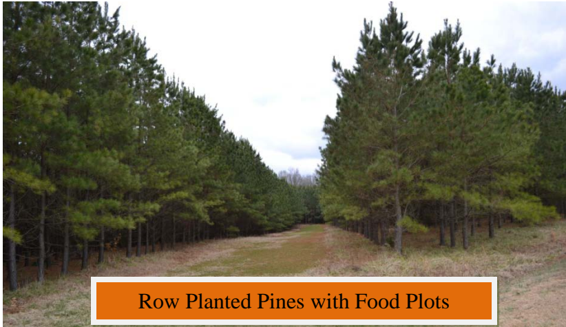
Row Planted Pines with Food Plots