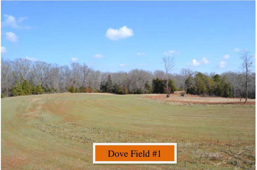
Dove Field #1