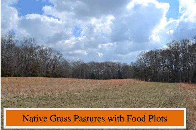
Native Grass Pastures with Food Plots