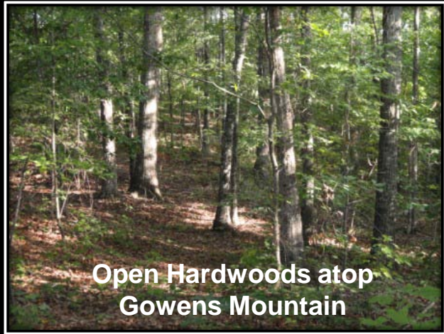
Open Hardwoods atop Gowens Mountain