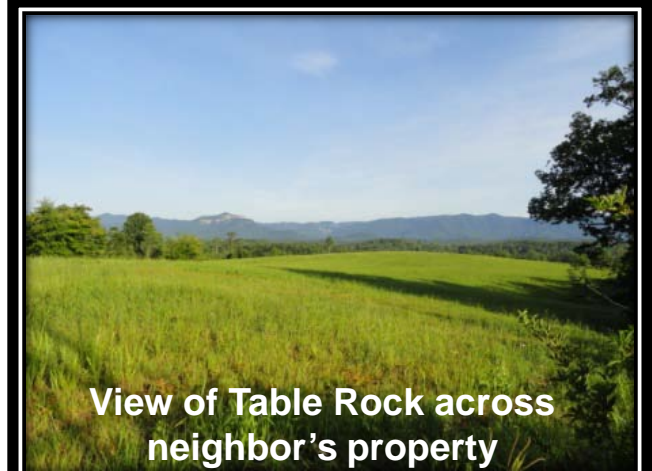
View of Table Rock across neighbor's property