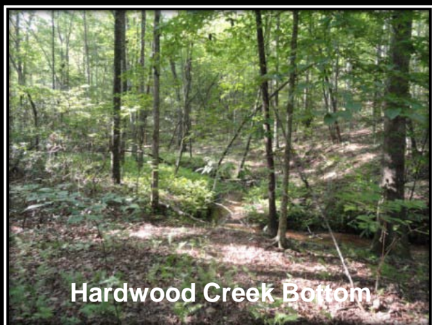
Hardwood Creek Bottom