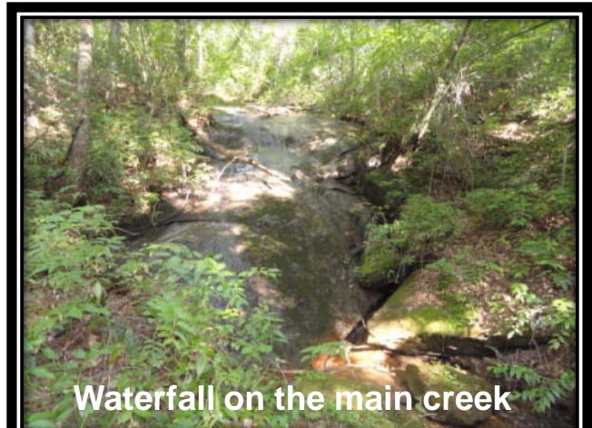
Waterfall on the main creek