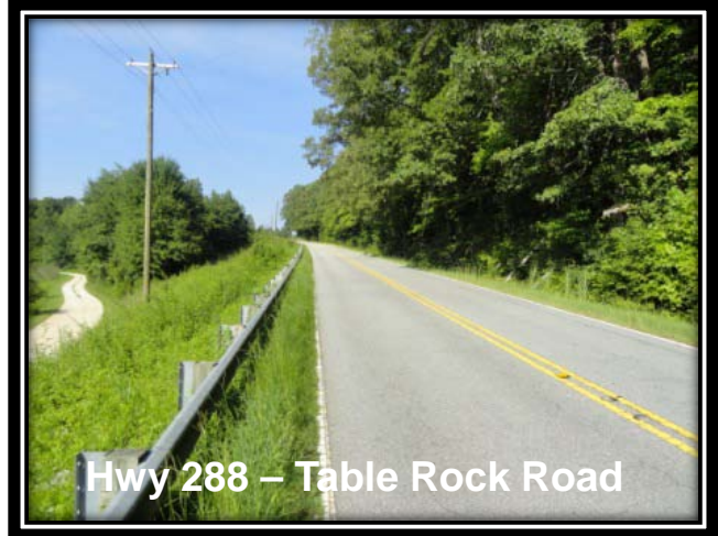
Hwy 288 – Table Rock Road