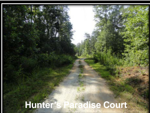
Hunter's Paradise Court