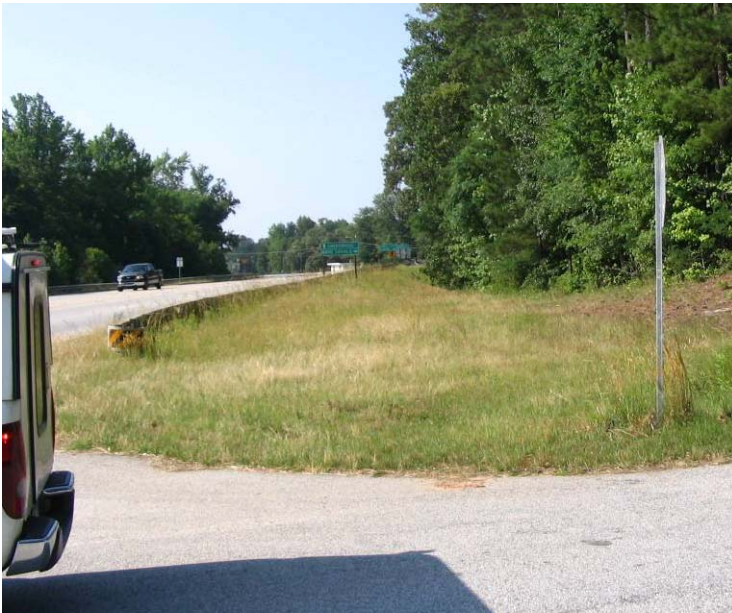
View from Intersection of Burnt Bridge Rd. & Hwy 25.

*AADT: Average Annual Daily Traffic (Number of vehicles)