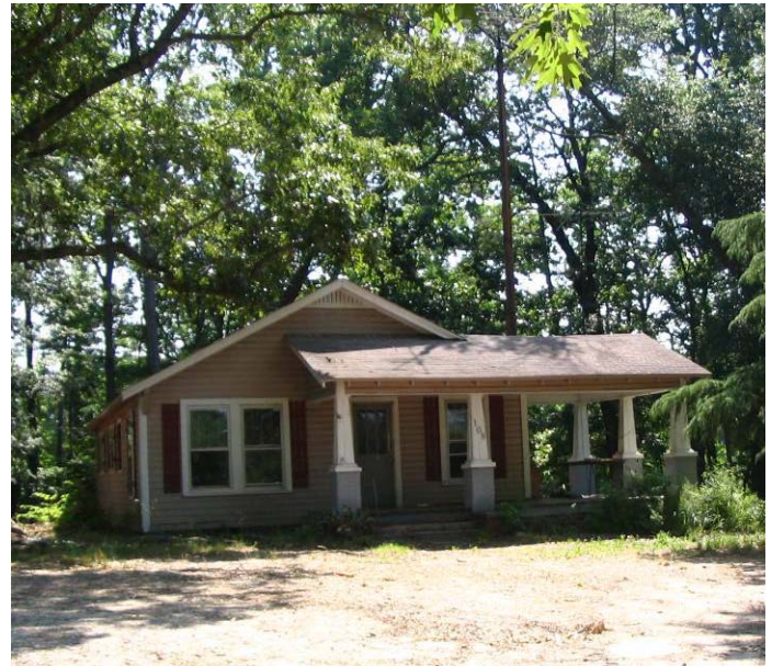
House on property sold "AS-IS"