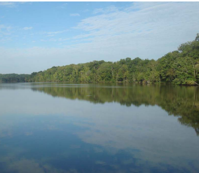
View of shoreline & Lake Greenwood

The total package for any outdoor enthusiast, developer, investor and tree farmer. This parcel features mature hardwoods and over 245 acres of 23 year old managed pines. About a mile of Dockable frontage on Lake Greenwood gives you opportunity to develop or preserve this landmark property. The tract was originally priced at $5,000,000 and recently adjusted to $2,500,000 to reflect today's economic conditions. Don't miss your chance to buy a pristine tract on big water at a great price!