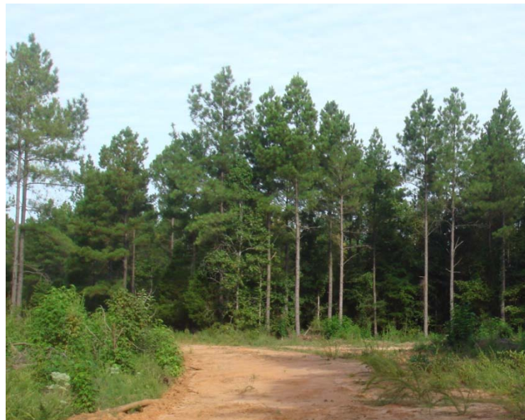
Pine plantation & established road system