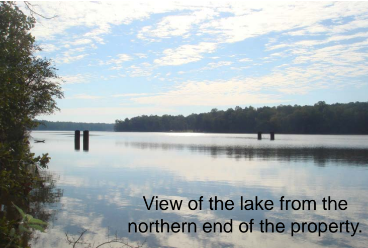
View of the lake from the northern end of the property.