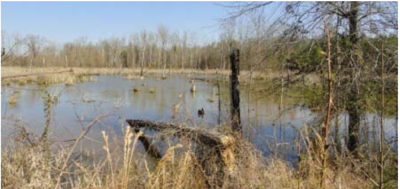
Large natural duck pond at the northern end of the property

Maximum “bang for your buck” in a small to medium timber tract! 90 acres of 2000 Loblolly that will be ready for it's first thinning in a couple of years. Gravel road frontage and an internal road providing access to the property. Very good deer and turkey hunting in this area of the county. The northern property line is a tributary of Rabon Creek that has a large natural pond on it that is full of waterfowl. Convenient location that is easily accessible to Greenville, Greenwood and Laurens.