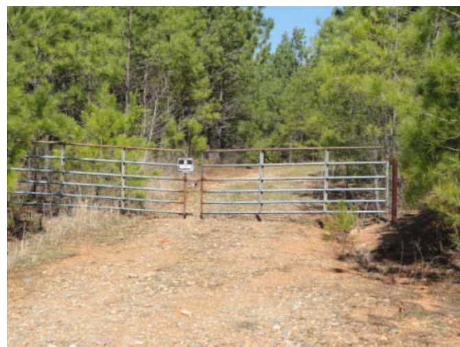
Access from Nelson Road