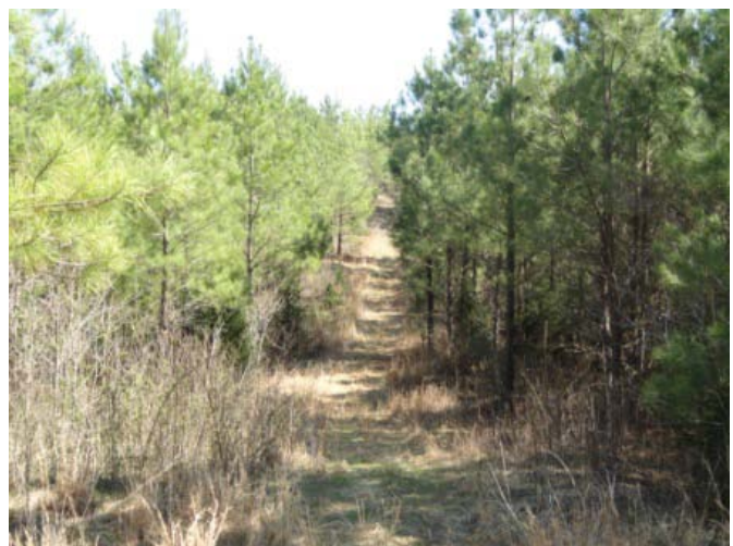
Interior woods road