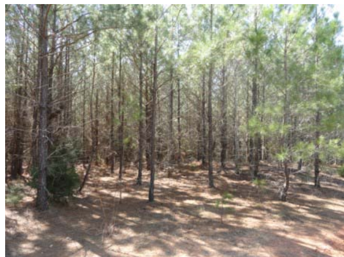
Loblolly pine planted in 2000