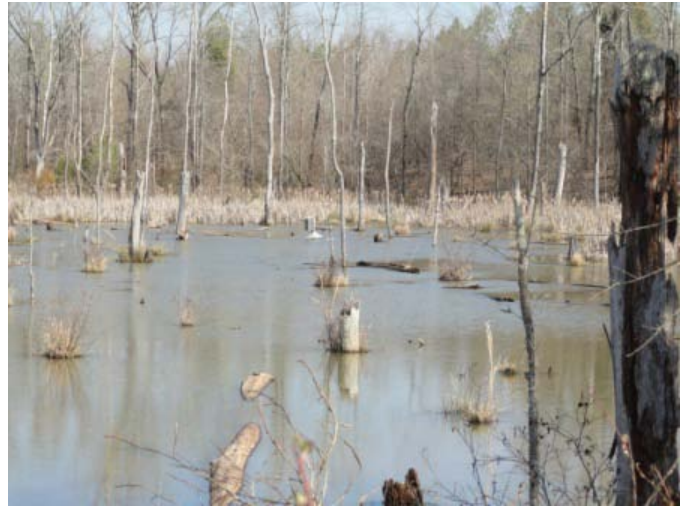
Wood duck heaven!