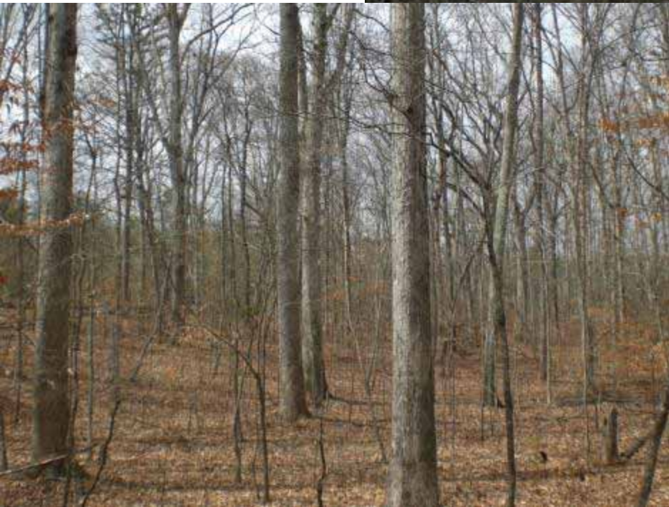
Majestic oaks in hardwood flat