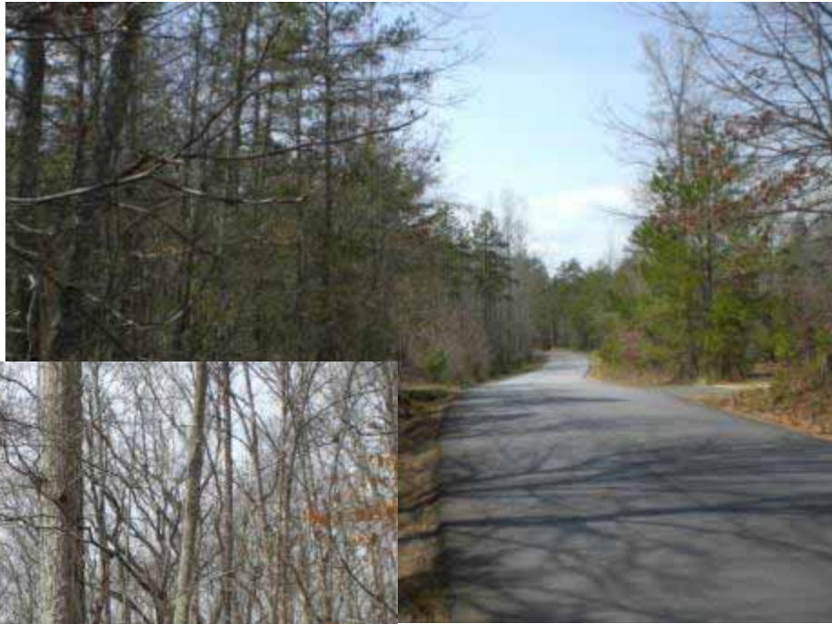
Good frontage on Lickville & Finley Roads