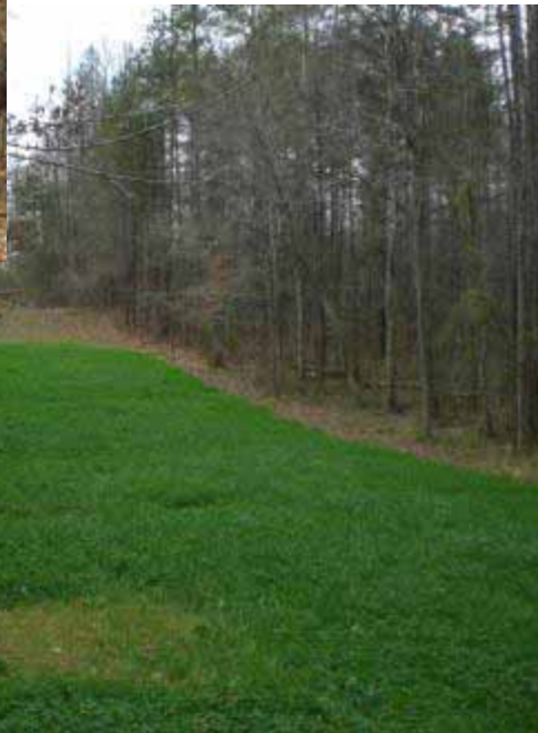
Wildlife food plot