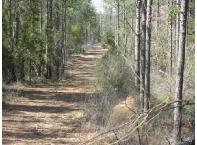
Woods road along back property line