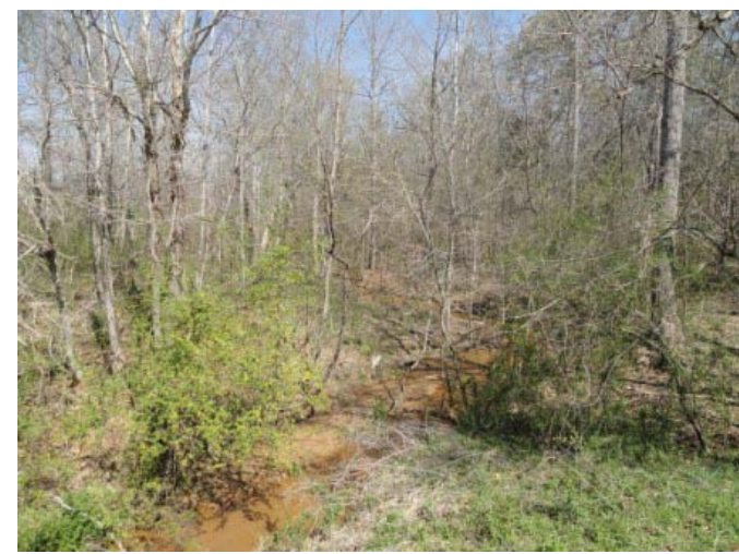
Little Turkey Creek