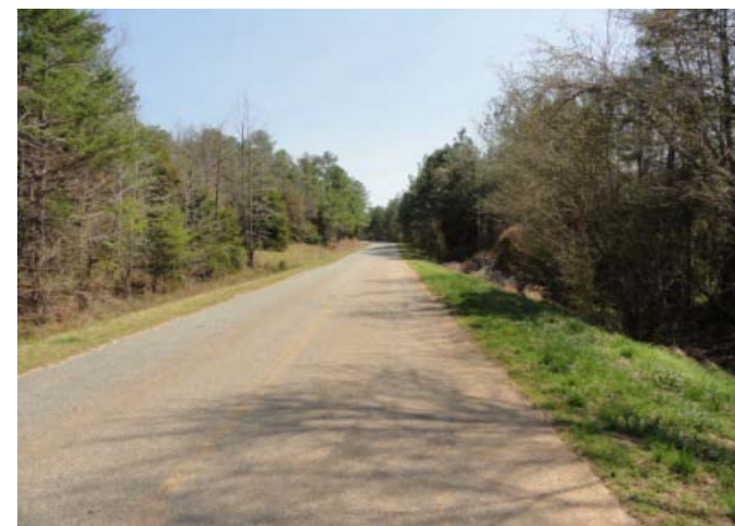
Paved frontage on Sam Hodges Rd