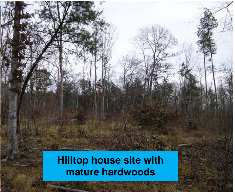
Hilltop house site with mature hardwoods