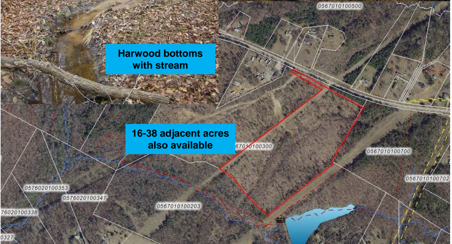
16-38 adjacent acres also available