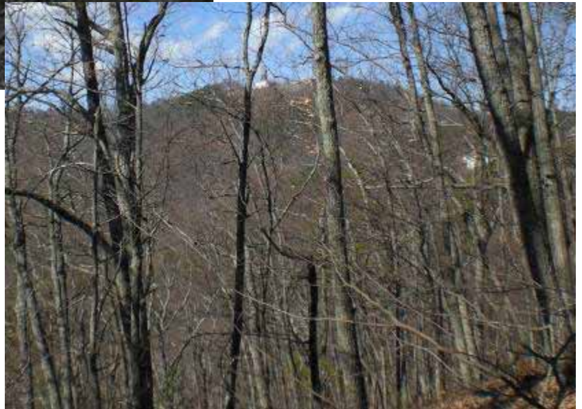
Northern View of Paris Mountain