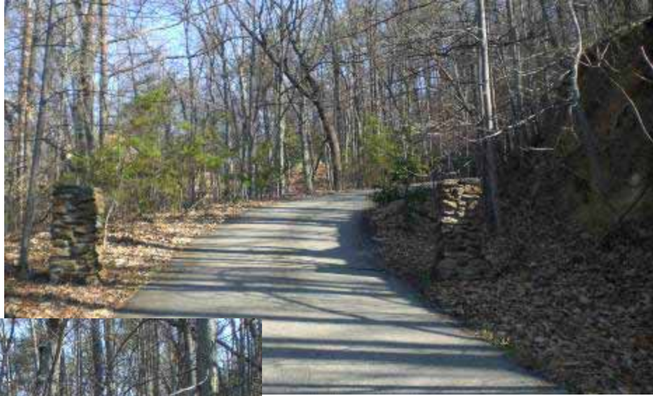
Shared drive into property