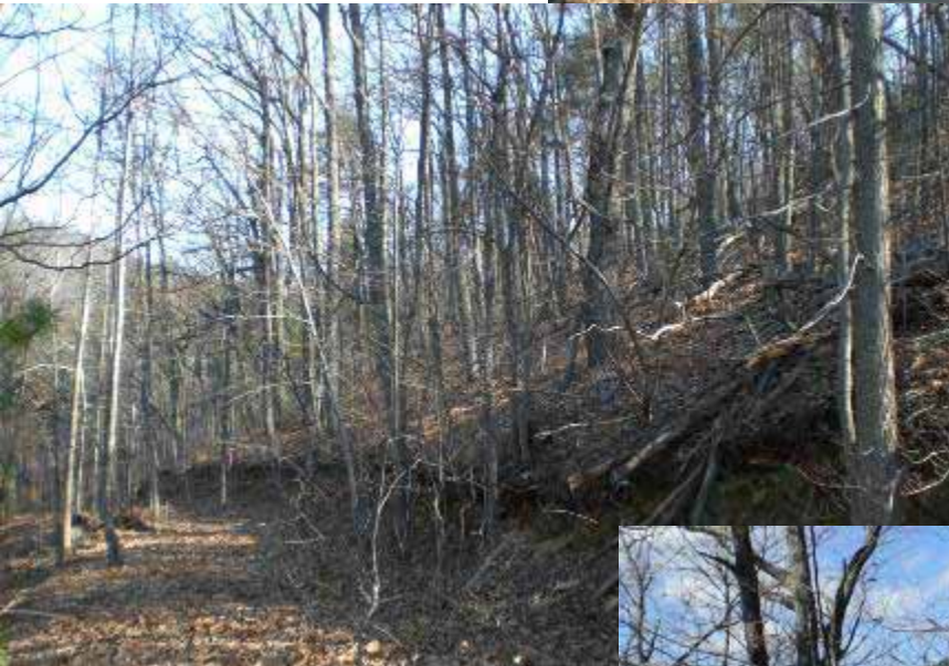
Roadbed suitable for access to housesite