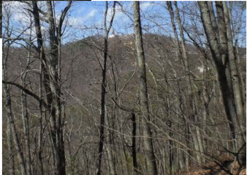
Northern View of the top of Paris Mountain