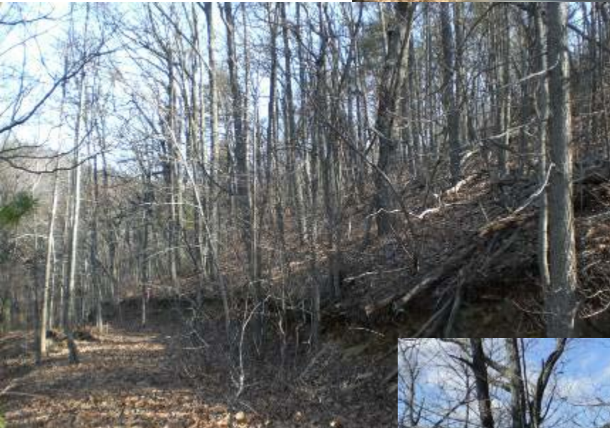
Roadbed suitable for access to housesite