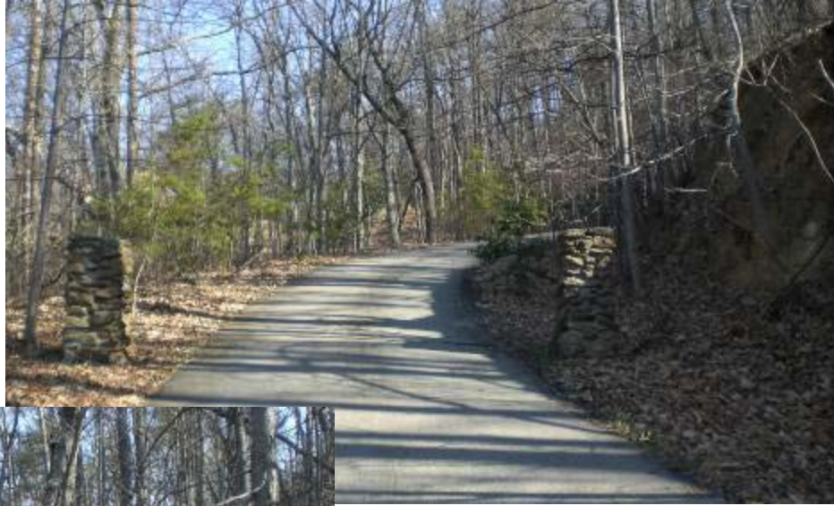
Shared drive into property