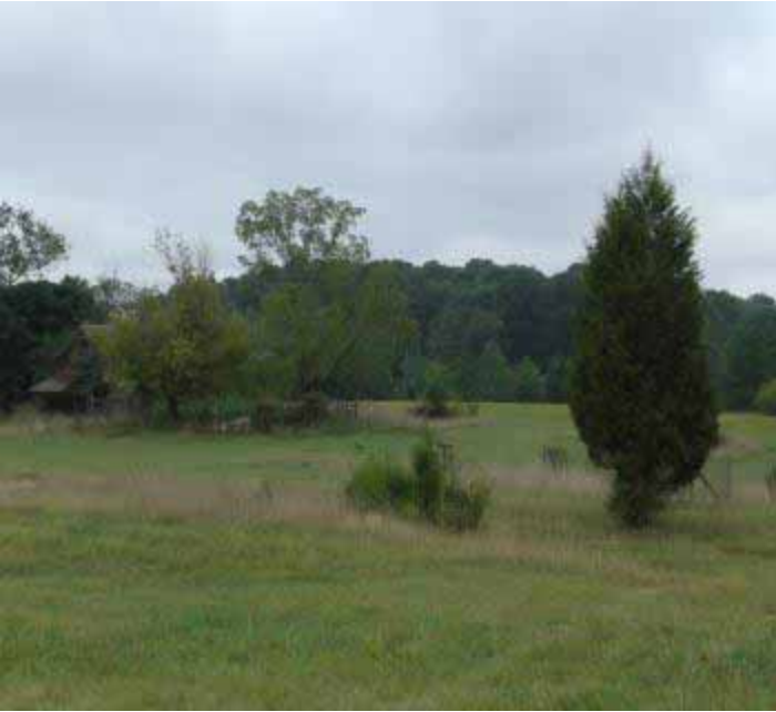
Old farmhouse in pasture