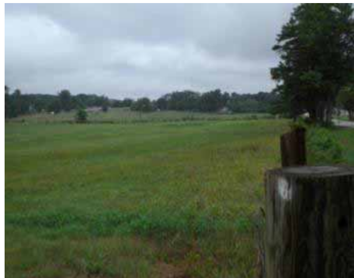
View along Old Pelzer Road

Call John Stillwell 864-414-1879 www.jenksincrealty.com