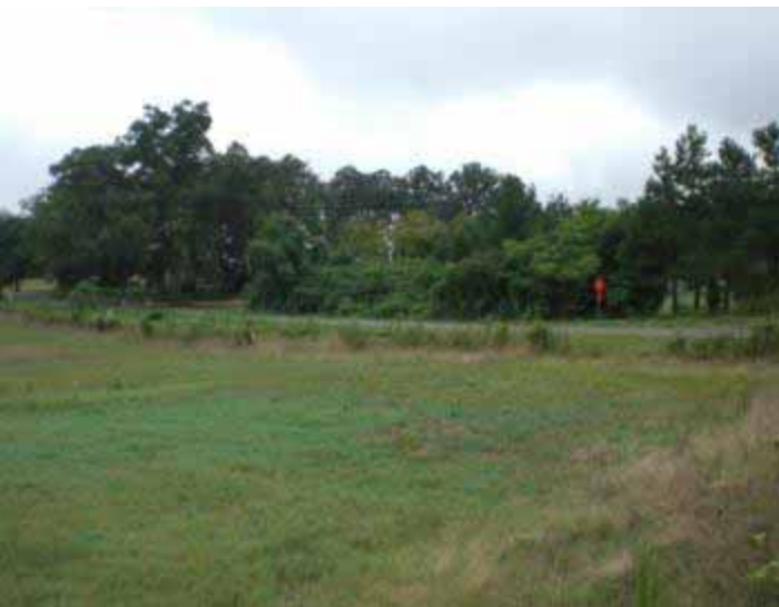
Rehobeth School Road Frontage