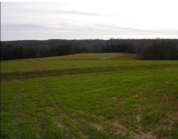
6 acre cleared field