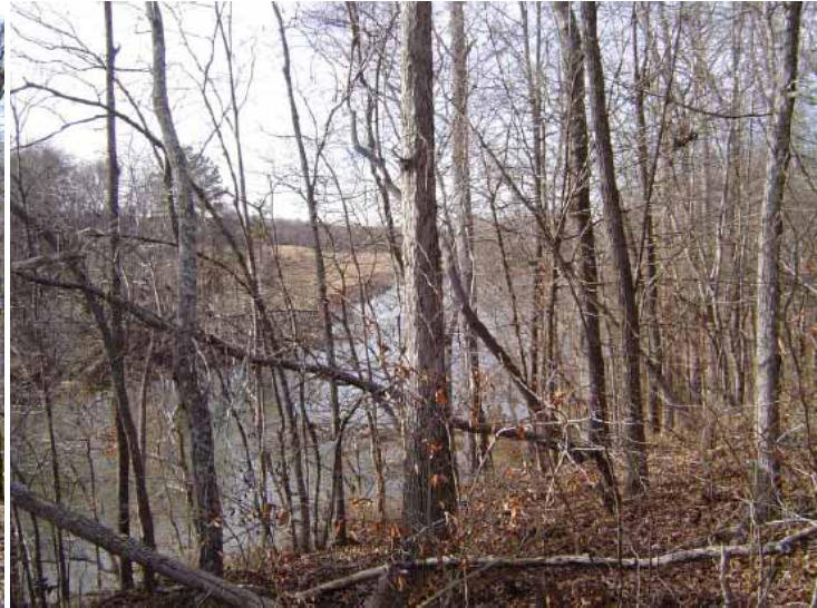
Saluda River bluffs