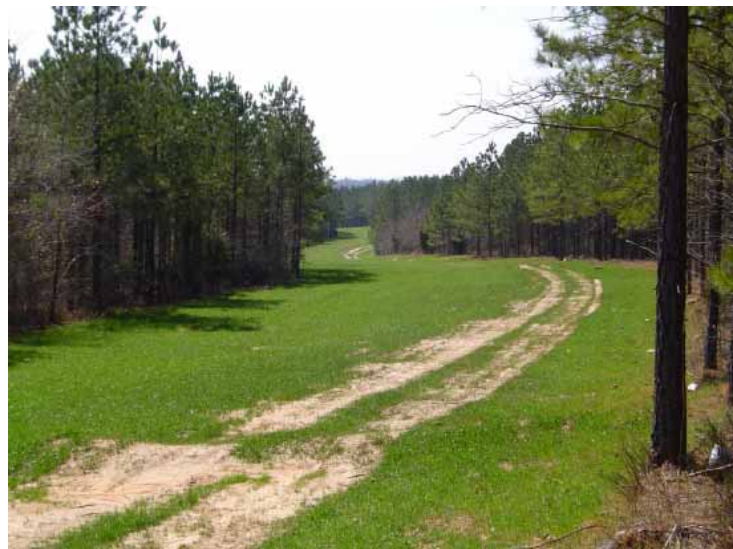
Established road system

Call John Stillwell 864-414-1879 www.jenksincrealty.com