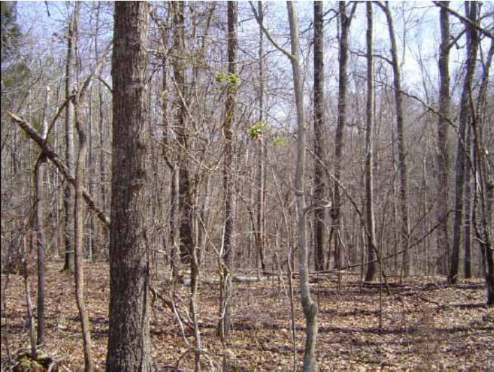
Beautiful open hardwoods