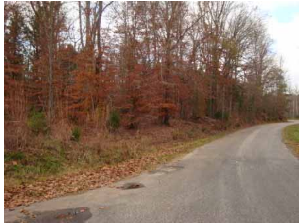
Stewart Dairy Road