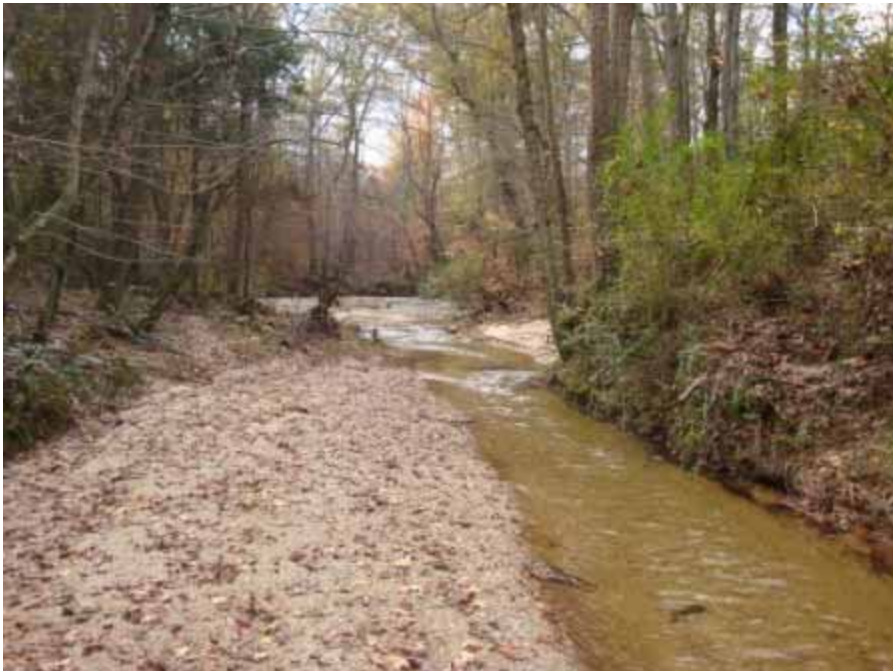
Beautiful frontage along South Durbin Creek!