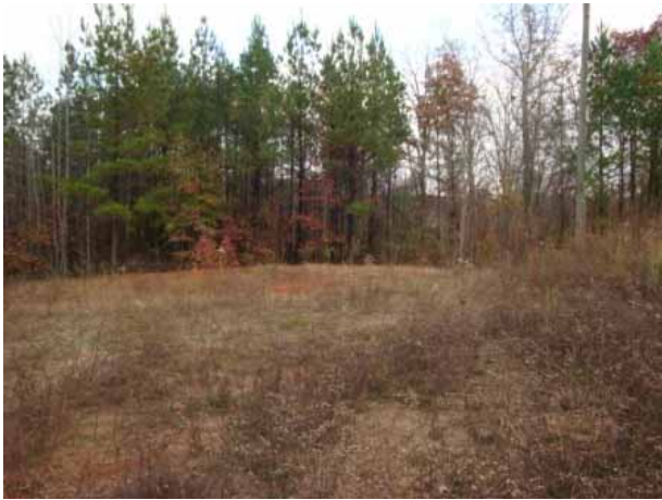
Homesite w/ all utilities