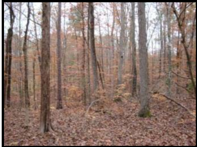
Mature hardwoods, red oak, white oak and hickory