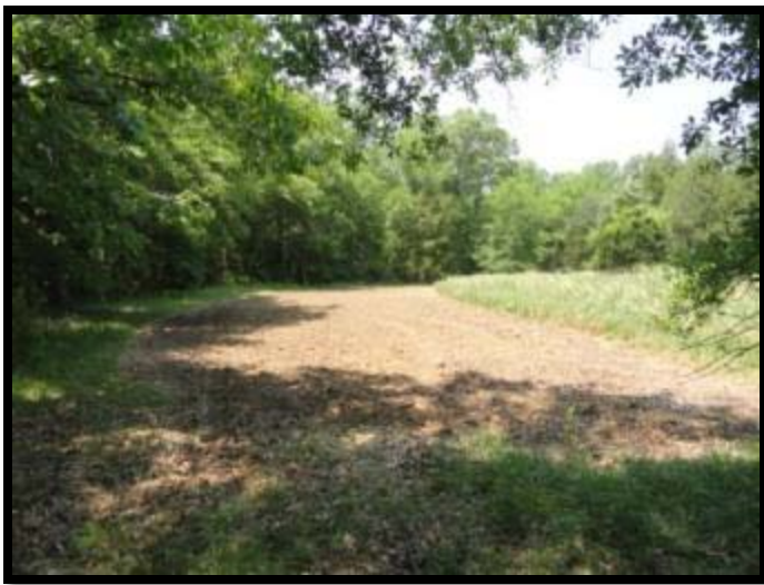
Wildlife food plot along the creek