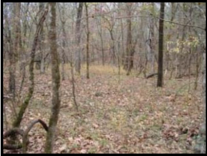
Hardwood bottomland along Calhoun Creek