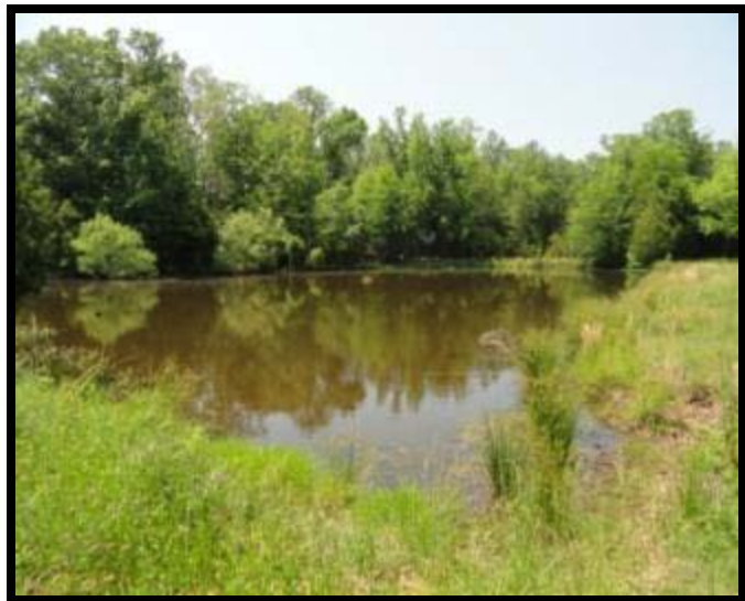
~1 acre fish pond